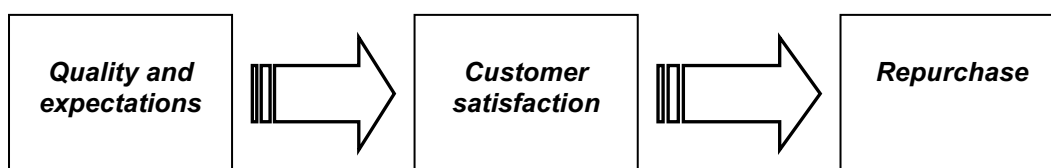
Figure 1: Customer satisfaction model (Source: Anderson, Fornell and Lehmann, 1994)

The dimensions that define assessment of satisfaction can be the same as dimensions defining assessment of quality, but this is not necessary. The assessment is based on ideals or the perception of perfection or excellence, while in the assessment of satisfaction expectations needs and personal norms also play an important role. That is why even very high service quality does not guarantee high customer satisfaction, because